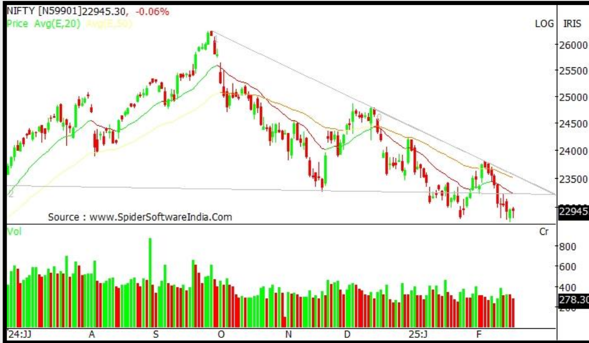
Daily Chart (22,945.30)