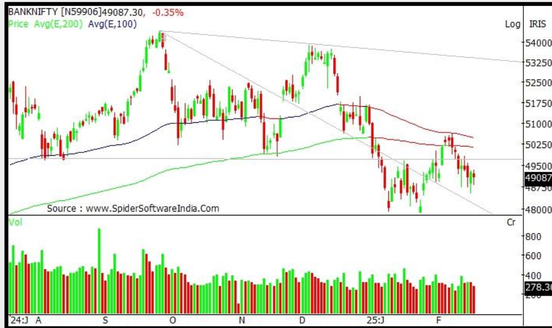
Daily Chart (49,087.30)